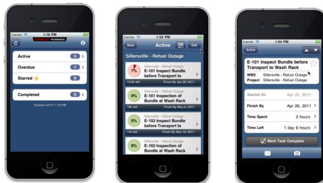
Figure 1. The P6 Team Member application enables users to easily make updates to their assigned tasks and send emails to update the project manager or other team members on the current status of the project from their iPhone.